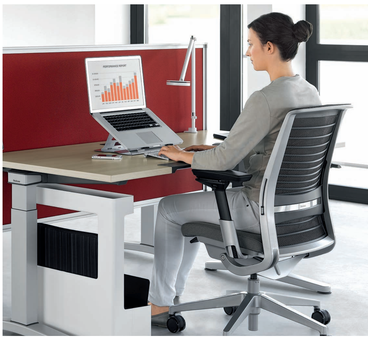
C9606 | THINK CHAIR (SL, 3D KNIT 01, AT04), OLOGY DESK (ZN, AT), PARTITO SCREEN (AT01)