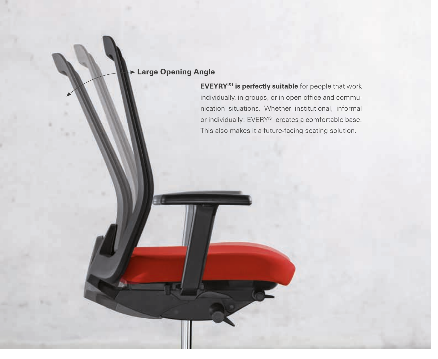
Particularly large opening angle: The recline option of the backrest, with autolift system, ensures comfort and relaxation.