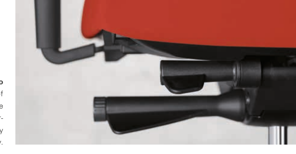
High quality mechanism with auto lift system: The restoring force of the synchronous movement with fine adjustment of the backrest counterpressure adapts itself to the body weight automatically.