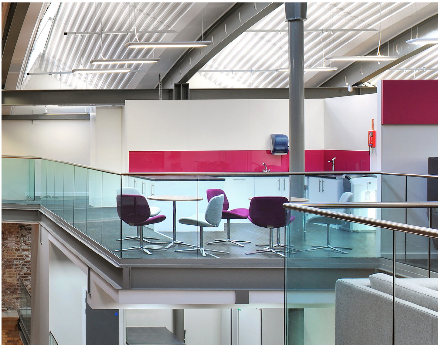
➔ York City Council - TRACK-03