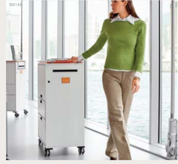
Light and highly mobile, it's easy to take Moby with you wherever you go.

Moby helps you to be effective in any work situation because you can simply take it with you and have the tools of your trade at hand. It lets you reconfigure your work environment according to your needs giving you the flexibilty to be on top of things wherever you want to work.