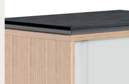
Black Oak CG Desktop: Slate 490 Fineline Oak F3 Carcass: Snow ZW